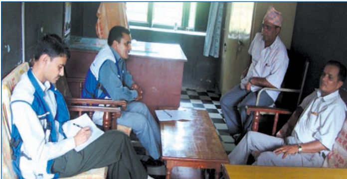
NHRC officials having discussion with the prison administrative officials at Tanahun District in West

Director General was also made aware that the NHRC monitoring team wasn't given the access to the prison in Pyuthan.