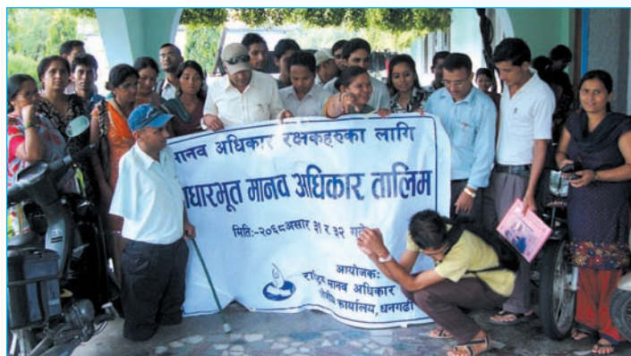
HR Defenders and Media Persons taking a group photo after the training session

thanks, suggested to have the follow up programme in near future and also take such training to the remote districts of the country.