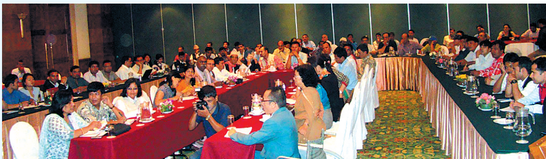
Representatives of various stakeholder organizations participating in the programme