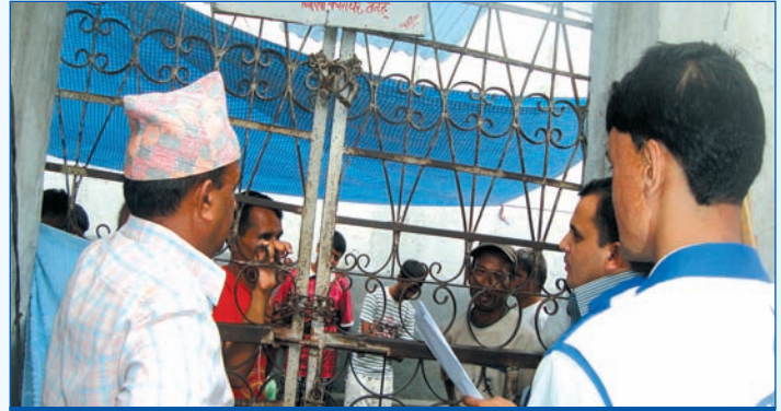
NHRC team and prison official during the monitoring on the condition of district prison in Tanahun in West

inmates. No inmates were found to be inflicted with physical or mental torture.