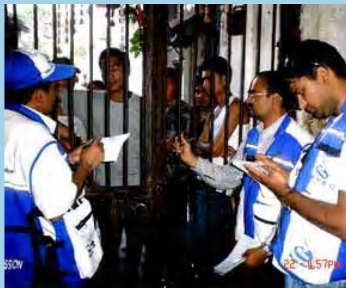
NHRC Team monitoring HR situation in Bhimphedi Jail, Makwanpur