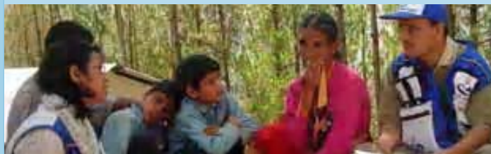
NHRC Team talking to HR Violation victim' families in Kavre district (above and below)