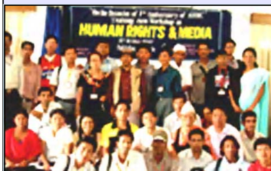
Participants of the training

Prior to the training the NHRC Biratnagar RO conducted media monitoring from May 14 to May 15 at